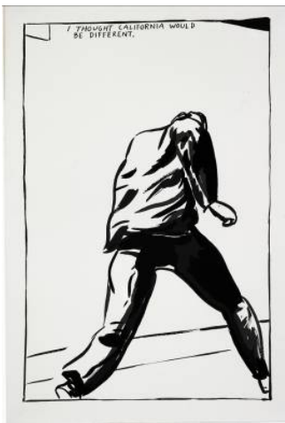
Raymond Pettibon, No Title ( I Thought California ), 1989; Lithograph

NEWPORT BEACH, CA— The 2008 California Biennial continues the Orange County Museum of Art's four-decade long history of presenting new developments in contemporary art. This year's biennial is guest-curated by Lauri Firstenberg, founder and director/curator of LA><ART in Los Angeles. Firstenberg's approach to the 2008 California Biennial is expansive—the exhibition includes works by more than 50 artists and, for the first time, incorporates off-site projects with collaborating venues from Tijuana to Northern California. The 2008 California Biennial is on view at the Newport Beach and Orange Lounge galleries from October 26, 2008–March 15, 2009.