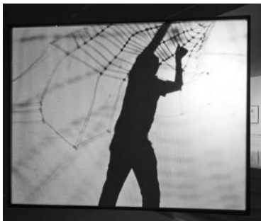
Carlos Amoraless, Discarded Spider , 2008; 16-mm film transferred to video; courtesy of the artist; kurimanzutto gallery, Mexico City, and Yvon Lambert Paris, New York

Newport Beach, CA— One of the foremost figures to emerge from the vibrant Mexico City contemporary art scene, Carlos Amoraless will have his first major west coast exhibition at the Orange County Museum of Art this fall. Carlos Amoraless: Discarded Spider features nearly 30 works including drawings, paintings, sculpture, and video work. The exhibition is on view from October 11, 2009–March 14, 2010.