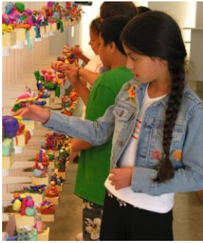
Museum visitors creating works of art with Charles Long's 100 Pounds of Clay , 2001; collection Orange County Museum of Art