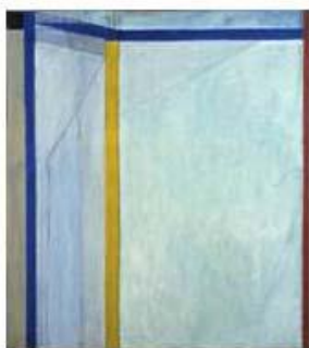
Richard Diebenkorn, Ocean Park #36 , 1970; Oil on canvas; 93 x 81 1/4 inches. Collection of the Orange County Museum of Art; Gift of David H. Steinmetz

Two Schools of Cool is organized by the Orange County Museum of Art and curated by Curator Sarah Bancroft.