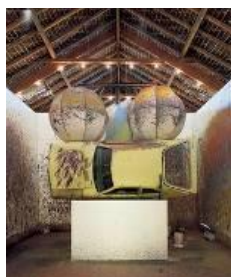
Richard Jackson, Painting with Two Balls , 1997; Ford Pinto, metal, wood, canvas, acrylic paint 20 x 36 x 20 ft; collection of Hauser & Wirth, Zürich

Richard Diebenkorn: The Ocean Park Series 1967–1988 is co-organized by the Orange County Museum of Art and the Modern Art Museum of Fort Worth. The exhibition is curated by OCMA Curator Sarah Bancroft.