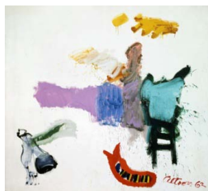
John Altoon, Ocean Park Series 1962