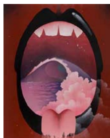
Pearl C. Hsiung, Tidal Wretch , 2005