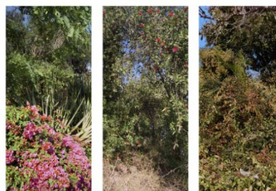
Walead Beshty, Island Flora , 2005