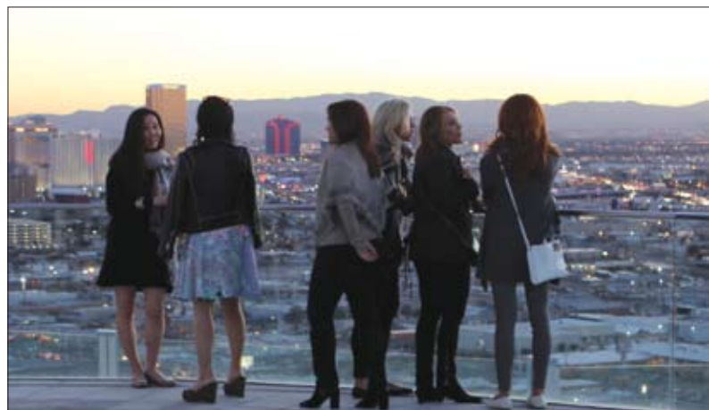
Visionaries in Las Vegas

Lastly, it's membership time again, and I hope that each of you rejoin as well as recommend membership to your friends. Visionaries, now in its 26th year, proudly has donated over $2,000,000 to the museum. Through our dues, we have participated in the building fund, supported exhibitions and catalogues and have underwritten many museum outreach projects. Thank you, Visionaries.